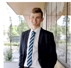
Fin JTS Realty 02 6541 5331