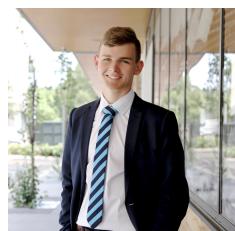
Fin JTS Realty 02 6541 5331