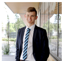
Fin JTS Realty 02 6541 5331