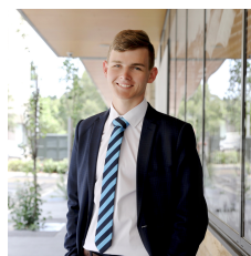
Fin JTS Realty 02 6541 5331